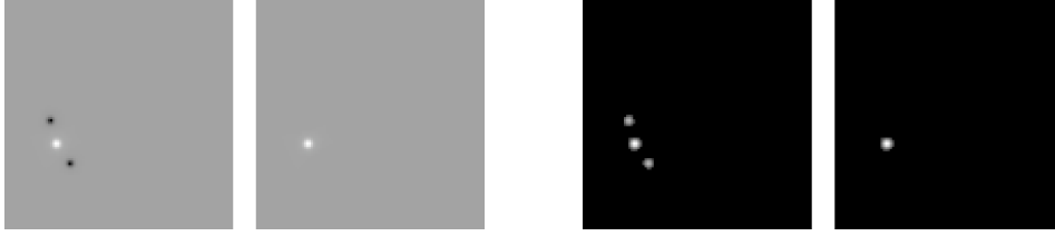
Fig. 2. Estimated flux map, without and with positivity constraint (1st and 2nd image) and corresponding J maps (3rd and 4th), for a theoretical noiseless case. We can remark the two sidelobes disappearing when the positivity constraint is applied.

linked to the probability of false alarm, is then to decide that all positions where the signal-to-noise ratio (SNR) of the estimated flux, defined as: